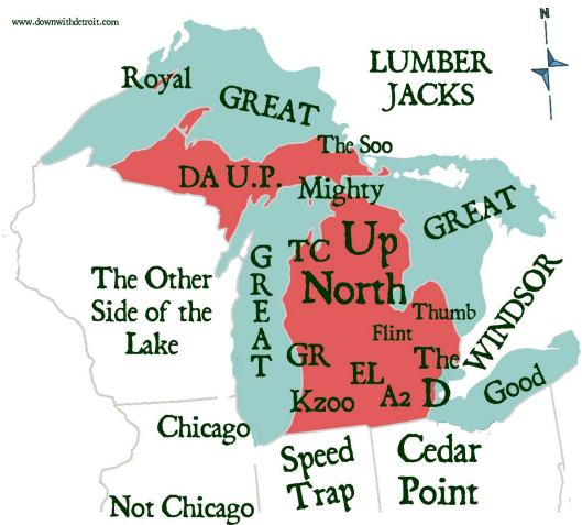
The World According to MICHIGAN