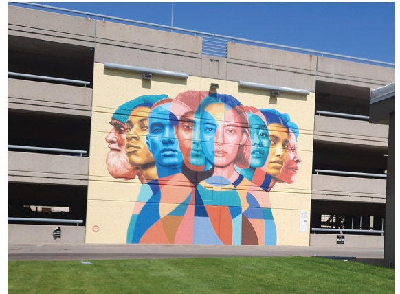
Image of Cole Eisenhour's "You Belong," visible from the Ogden Farmers Market grounds. Photo credit: Jaclyn Pace.